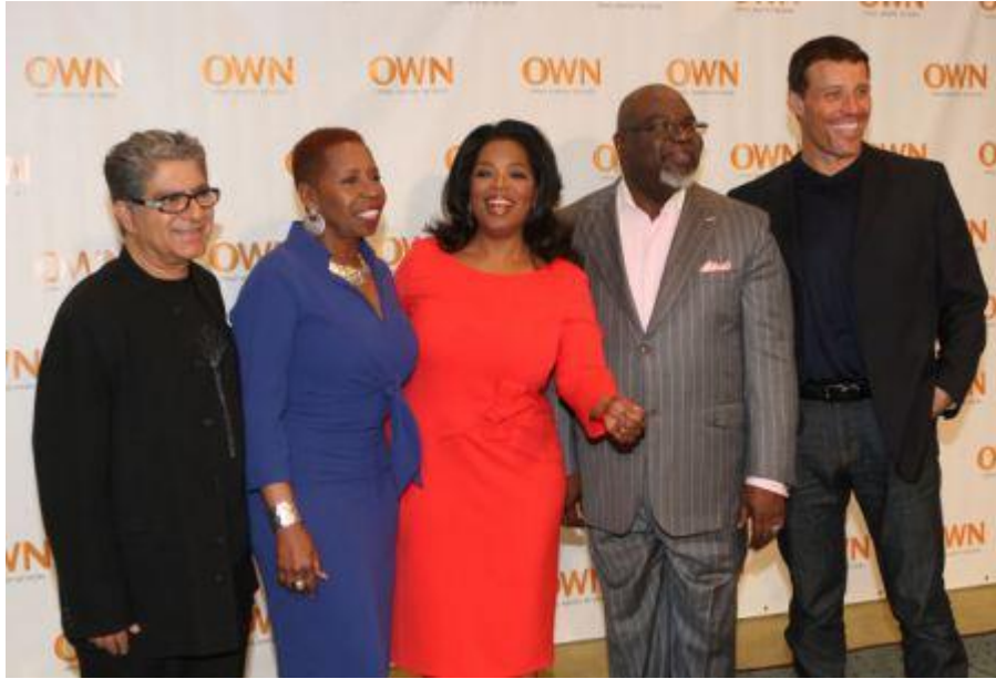
The 21st Century New Age Gurus – (left) Deepak Chopra, Iyanla Vanzant, Oprah Winfrey, T.D. Jakes and Toni Robbins on the red carpet at a Life Coach Show in Toronto Oct. 9, 2012.